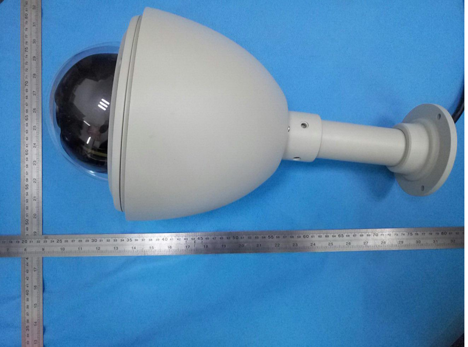
Fig 1. Overall view