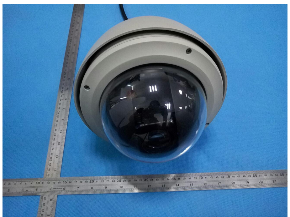
Fig 4. Part view