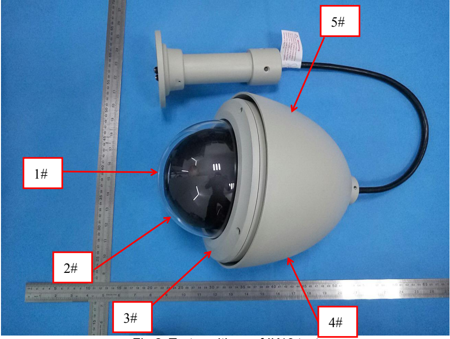
Fig 2. Test positions of IK10 test